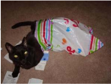
Ninja Martin, should we play or shop?

Cats are independent, but they are very loyal and love their owners. They love to play, run, jump and explore. Do you love to play, run and explore? If so, you can do these things with your cat.